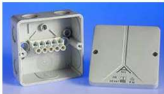
Weather Proof Non Metallic Enclosures