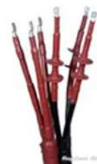
Jointing & Termination Kit