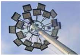
Street Light Poles