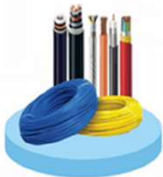
Wires & Cables