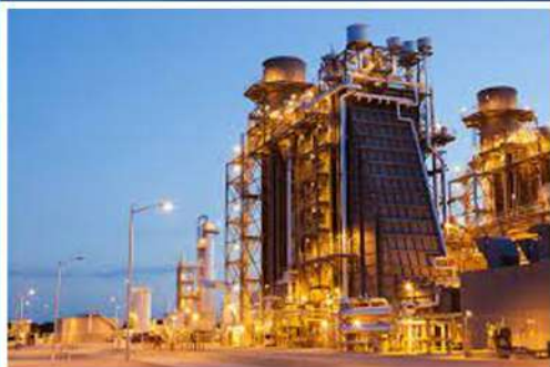
Power Plant / Industries