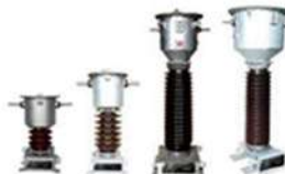
Current & Potential Transformer