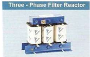
Active Harmonics Filter