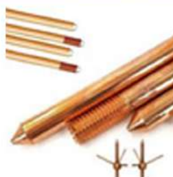
Earthing & Lightning