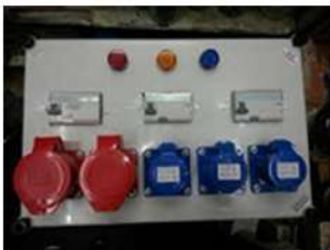
Polycarbonate Sockets (Industrial)