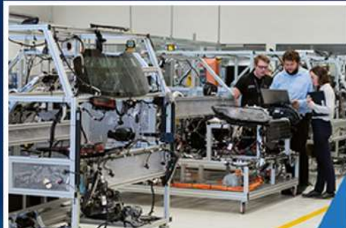
Original Equipment Manufacturers